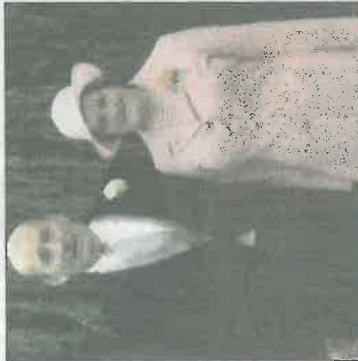
the age of 98.