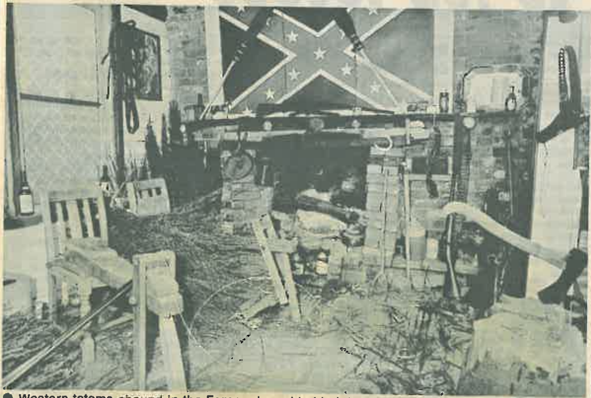
● Western totems abound in the Forge, alongside birch twigs and besom brooms.