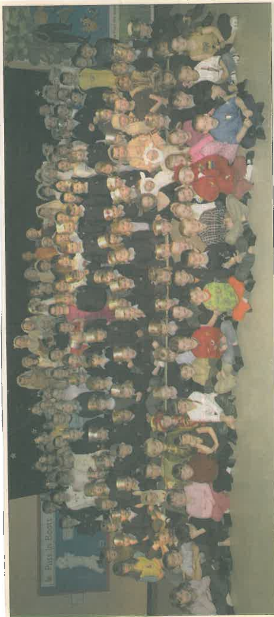
● Tadley Community Primary School

THE TADLEY GAZETTE, FRIDAY DECEMBER 20th 2002