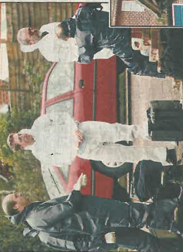
● Scenes of Crime officers and a forensic team prepare to enter the house.

POLICE have launched a murder investigation after a man was found dead in his bedroom.