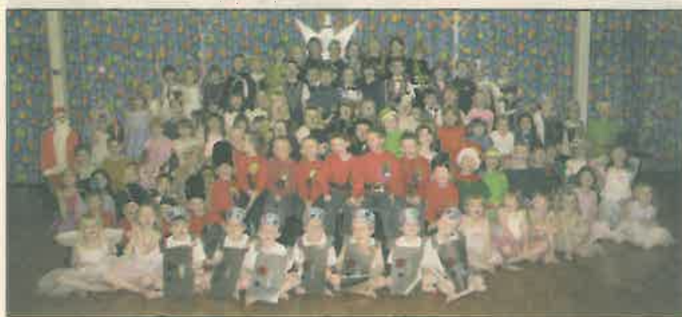
● Bishopswood Infant School