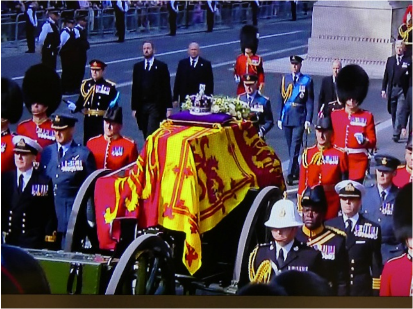
Her Majesty Queen Elizabeth II 1926-2022