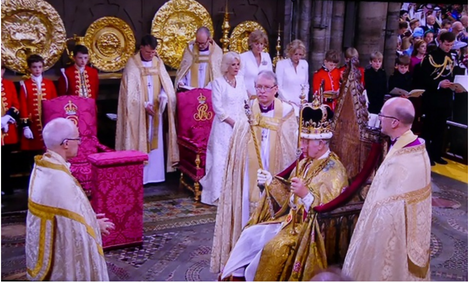
The Coronation ceremony in Westminster Abbey