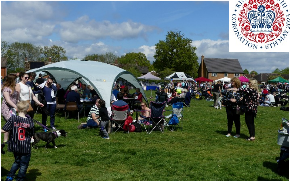
The party on the Green, Tadley