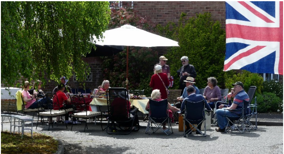
A street party in Pamber Heath