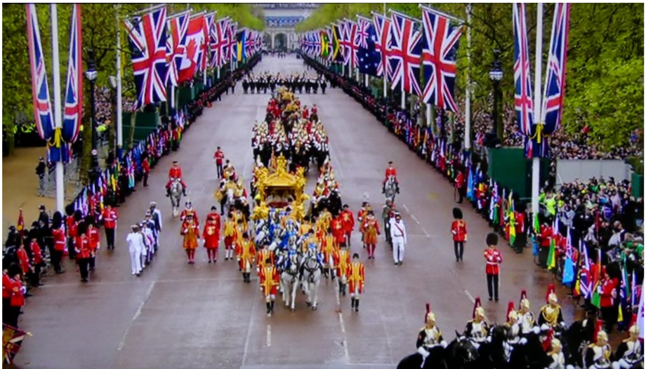
The Coronation coach approaching Buckingham Palace