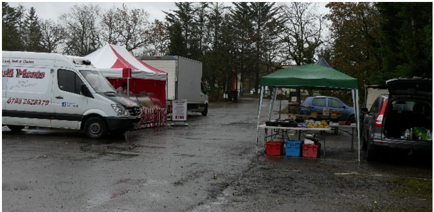
Above: 3 Dec 2023. Below: 1 Feb 2008