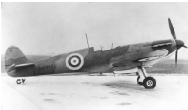
Spitfire K 9912 a companion aircraft to K 9917