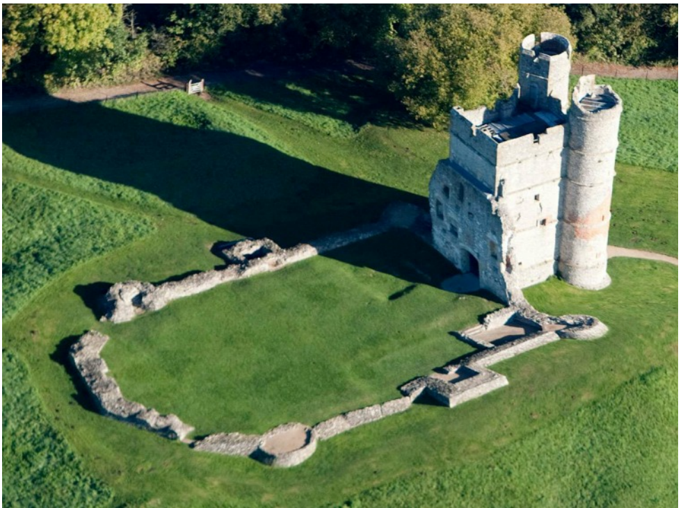
Donnington Castle today.

The Castle is in the care of English Heritage. Their website has a lot more about the history of the castle and its owners.