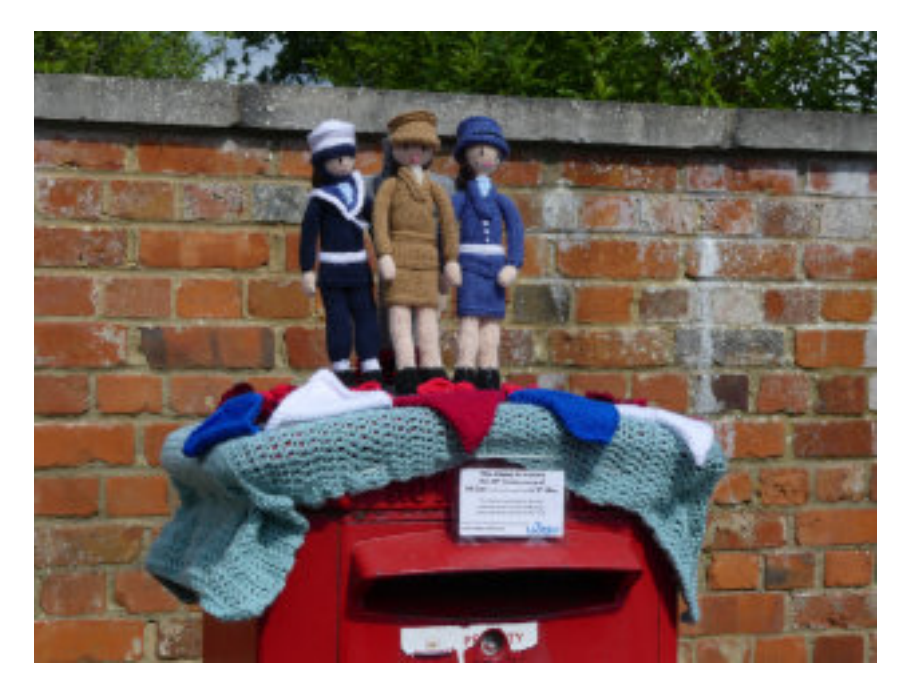
Two of the many superb VE Day displays by Tadley U3A knitters