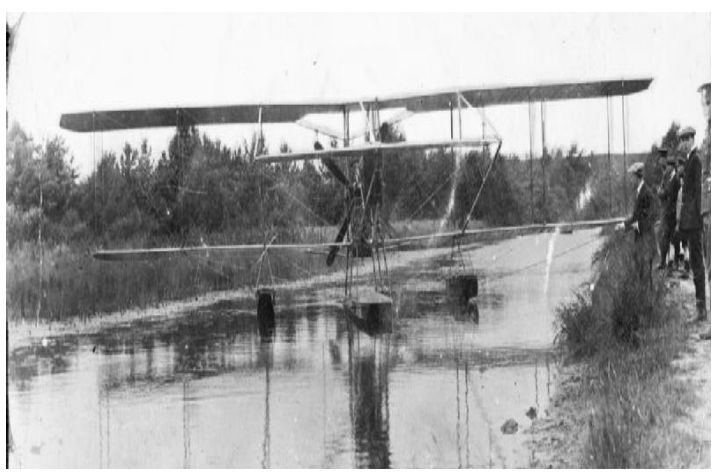
Cody aircraft mark VIB Hydroplane on the Basingstoke Canal, Cody at the controls. People on the tow path are pulling on a rope attached to the aircraft.

Early on the morning of 7 August Cody carried out a 70-mile (113 km) test flight around Farnborough, from Laffans Plain near Aldershot. The plan was to then fly down to Calshot, Southampton, where the aircraft would